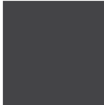
PRIMARY COLOR Coal Grey

For accurate color reproduction, use the values on this page according to the recommendations of the printer, medium being used and application.